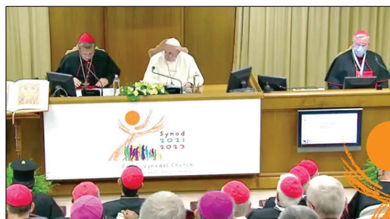
Pope Francis takes part in a moment of reflection for the opening of the Synodal path at the Vatican's New Synod Hall.

It went on: "Aware that a synodal Church is a Church that listens, considering that this first phase is essential for this synodal path and evaluating these requests, and always seeking the good of the Church, the Ordinary Council of the Synod of Bishops has decided to extend until Aug. 15, 2022, the deadline for the presentation of the summaries of