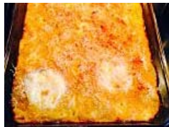
15 best Sunday Dinner Recipes Foodie