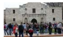
Top 10 Texas counties by population growth