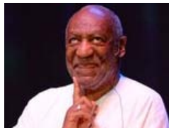
Flashback: 2003 Bill Cosby Interview With Sofia Vergara is Sooo Creepy Vocativ