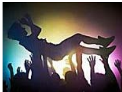
11 Things You Should Never Do Again After 50 AARP