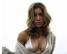
Photos: 20 Most Sizzlin Celebrity Female Bodies RantChic