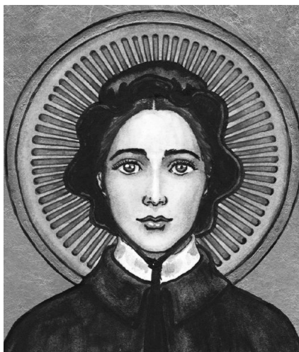
St. John Bosco and St. Elizabeth Ann Seton Patrons of Catechists and Catechesis