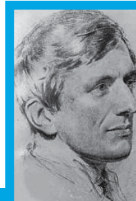
Bl. John Henry Cardinal Newman 19th Century Apologist

WHERE: Blessed Sacrament Catholic Church Hall 600 Oblate Drive, San Antonio, TX 78216