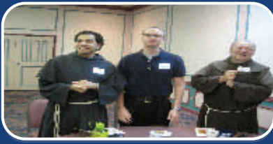
Hispanic Communities 2011